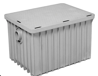
A Typical Grease Trap