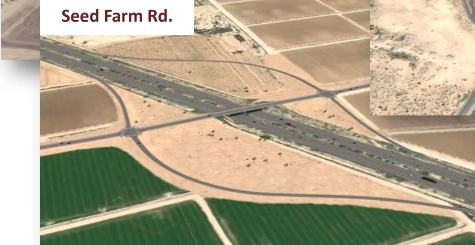
Seed Farm Rd.